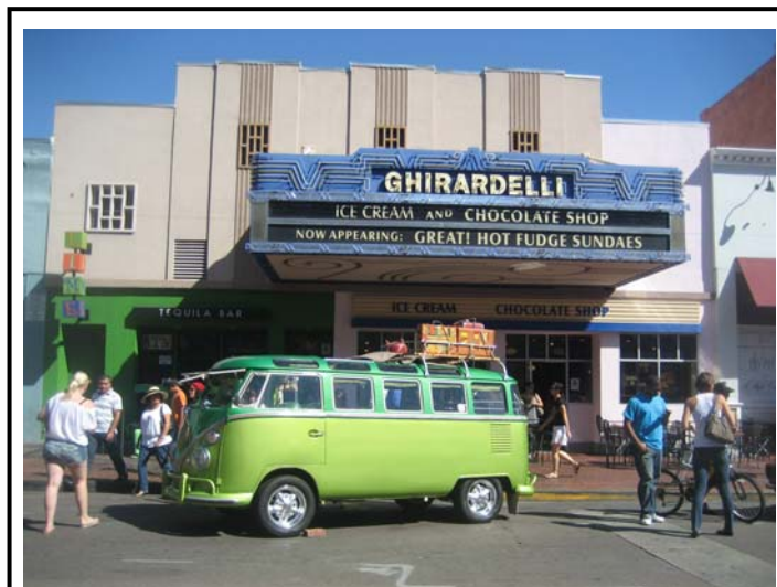
VW "Samba" Mini-bus