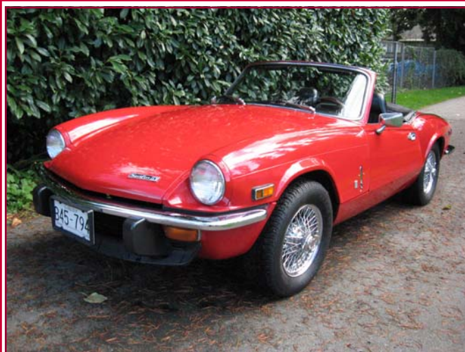
Completed Engine and Chassis