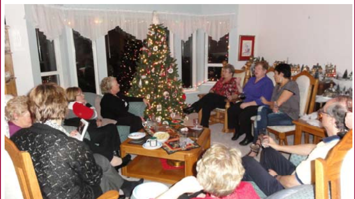
Relaxing in the beautifully decorated living room

Happily, there was no snowfall as there was last year, so everybody was relaxed and had a good time.