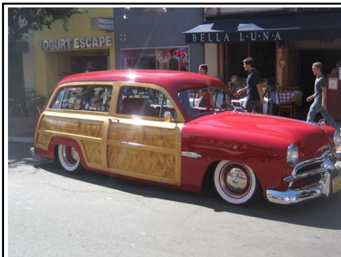
California!! A 1950 Ford Woodie!!

it to the Fifth Avenue Show in the Gaslamp Quarter. This is an annual show that takes up several blocks, much like our Gastown show. A great showcase of the varied auto tastes of Southern California. There is also a shop on Fifth Ave selling collector cars, and had just sold a TR2 for over $30,000. You can check out their offerings at www.bhmotorcars.com . By this point my family was really doubting the coincidence of all the car events just happening to be where the cruise ended.