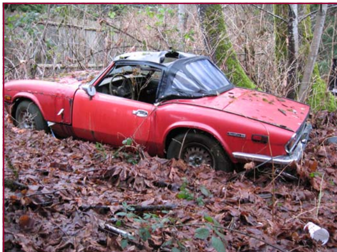
Nice parking place ... a little hard on the bodywork

BCTR: What kind of shape was it in and how did you find it?