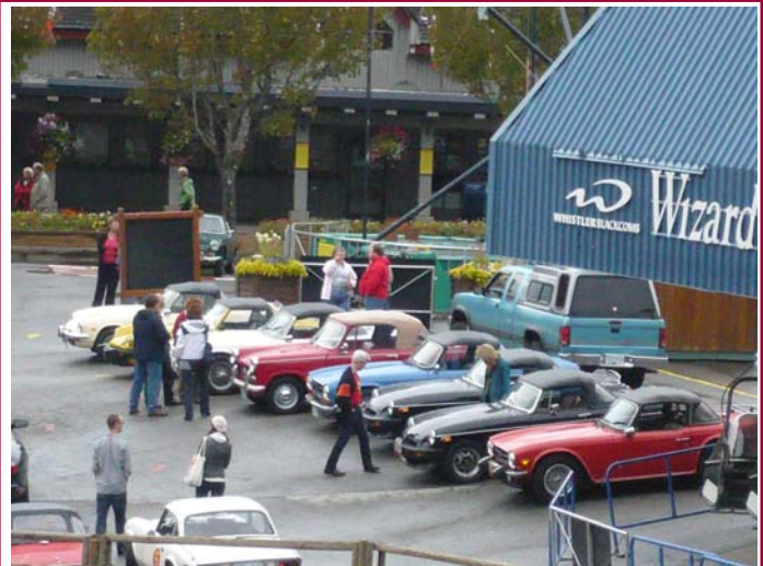
A great showing of British Automobiles

A group of us stayed for a couple extra nights at