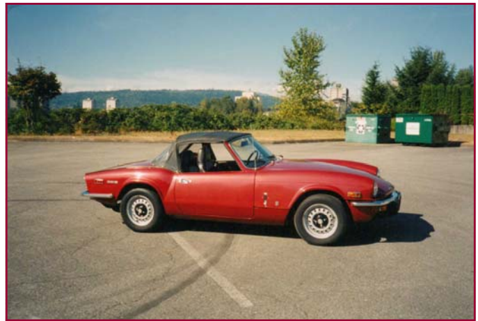
Spitfire in original maroon colour

BP: Actually, she doesn't drive it .. She tried a few times but didn't really enjoy drivingit.