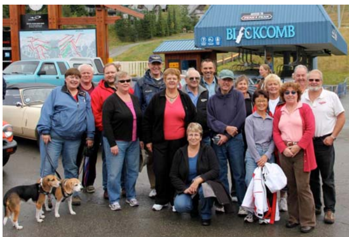
BCTR Representation at the run

Whistler to enjoy the area. A suggestion was made to visit the Pemberton Distillery – the makers of Schramm potato vodka. We met the master distiller (who completed his Master of Science in distillery arts in Edinburgh, Scotland). The distillery had several stainless steel pots, some with copper tops that slowly distills organic potatoes from the local farmers. Pemberton Distillery is a family-run business that produces a sipping vodka that is to be enjoyed like a fine scotch. Pemberton Distillery entered its Schramm Vodka in the World Spirit competition this year and won a double gold award for its spirit. During the