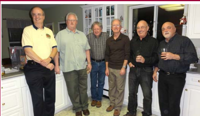
A few of the boys hanging out in the kitchen