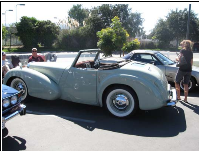
Triumph 2000 Roadster

it to the Fifth Avenue Show in the Gaslamp Quarter. This is an annual show that takes up several blocks, much like our Gastown show. A great showcase of the varied auto tastes of Southern California. There is also a shop on Fifth Ave selling collector cars, and had just sold a TR2 for over $30,000. You can check out their offerings at www.bhmotorcars.com . By this point my family was really doubting the coincidence of all the car events just happening to be where the cruise ended.