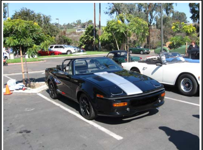
Hot looking TR8

My timing did improve on the weekend. There was an Italian festival, with a car show the following day. That is the first time I have seen 10 Panteras at one time. Right after that I made