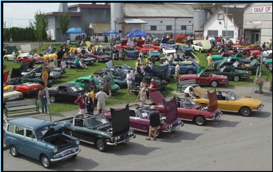
All Triumph Drive-In 2007

A QUARTERLY NEWSLETTER FOR THE TRIUMPH ENTHUSIAST FROM THE BC TRIUMPH REGISTRY. WEB: WWW.3.TELUS.NET/BC_TRIUMPH_REGISTRY email: BCTRIUMPH@GMAIL.COM