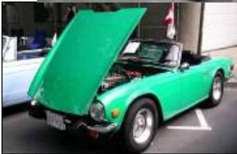
Ladner Car Show and Quilt Walk August 19, 2007