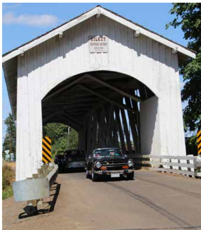
Keith and Ellen driving through a covered bridge in Oregon - August 2015